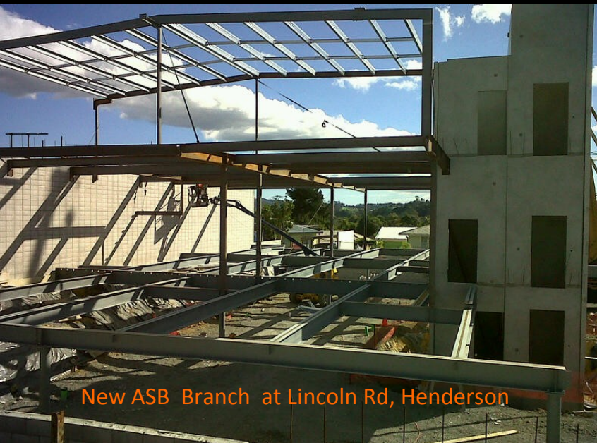
New ASB Branch at Lincoln Rd, Henderson