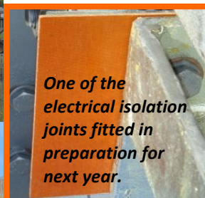
One of the electrical isolation joints fitted in preparation for next year.