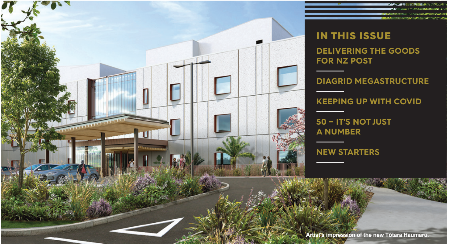
Artist's impression of the new Tōtara Haumarū.