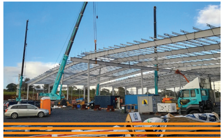
Above: 24 Custom Welded Beam portals provide the largest possible clear-span envelope, so the fitout won't be impeded by the supporting structure.